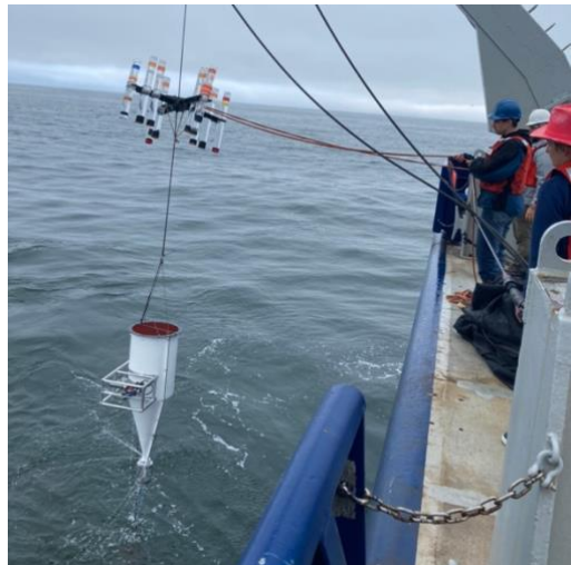
Figure 1- Visustrap (bottom left) deployment off California

Context: In modern oceans, photosynthetically produced organic matter is exported from the surface to the deep ocean, a process described as the Biological Carbon Pump. One of its key mechanisms is the gravitational settling of particles (e.g., fecal pellets, marine snow), which is influenced by the nature of the particles (e.g., size, density, the presence of ballasting minerals) and thus their sinking speeds. Knowing the magnitude of carbon export, and subsequent sequestration in deep sea sediments, therefore requires knowing the speed at which particles can travel to the deep ocean. Sinking speeds have often been estimated according to Stokes' Law, but it assumes that particles are perfect spheres, which is almost never the case in marine environments. Thus, measuring the speed of sinking particles directly in their environment would help to refine carbon flux estimations. To reach this objective, we use imaging techniques, a growing field of ocean observation (Lombard et al., 2019). We developed the VisuTrap system, which is composed of an in situ camera UVP6 (Picheral et al., 2022) mounted in a cylindro-conic sediment trap. The trap aims at isolating a water mass so the camera can record the tracks of the sinking particles. Then, images are